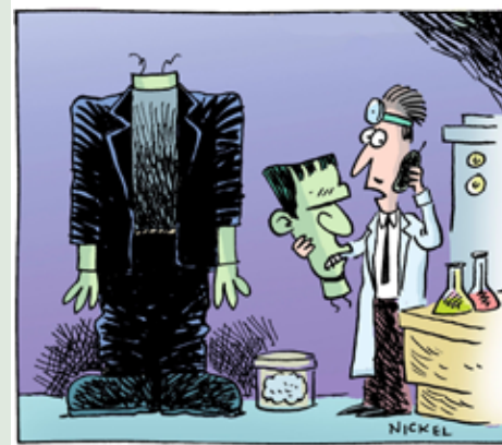
“Hello, tech support?”