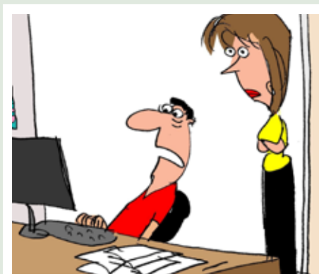
““Unexpected error.” It stopped being ‘unexpected’ after the 10 times it happened.”