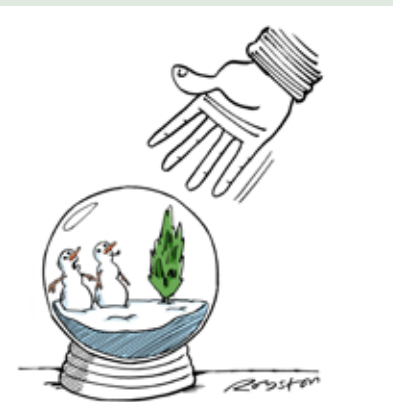
"Looks like we're in for another extreme weather event."