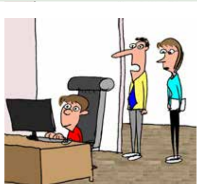
“I think these ‘take your kid to work’ days are just a ploy to get free tech support.”