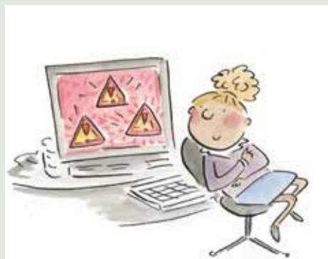
"I didn't see any compliance issues."